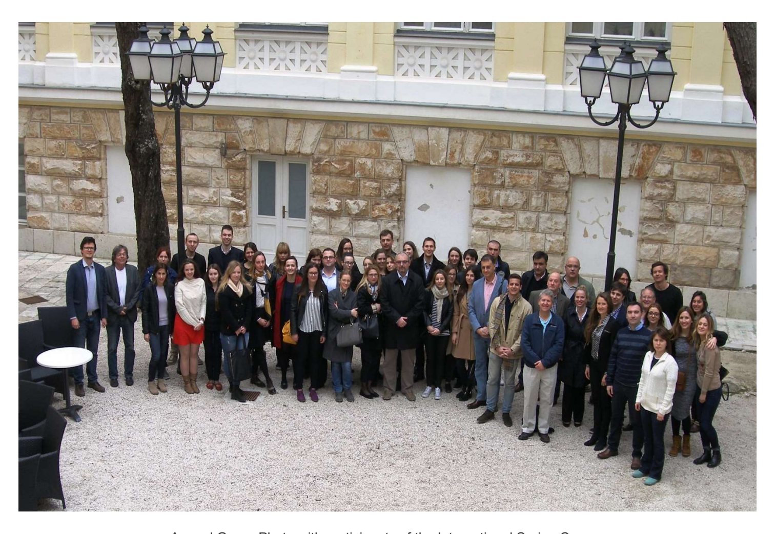
Annual Group Photo with participants of the International Spring Course Crime Prevention through Criminal Law & Security Studies (Inter-University Centre, Dubrovnik, Croatia)